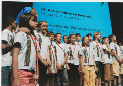
SWISS ABROAD

The next Congress of the Swiss Abroad will take place in Lucerne from 7 to 9 August 2009.