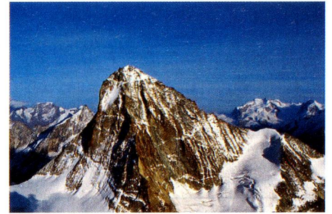
Dent Blanche (Valais), from "Altitude 4000", see P. 7.