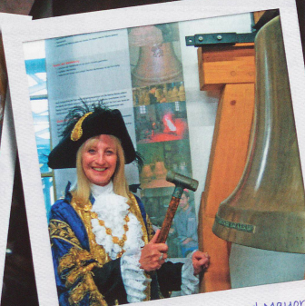
How's this for sound? The Lord Mayor tests one of the refurbished bells