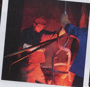
casting under way in Switzerland's oldest foundry, the Glockengiesserei in Aarau

Leicester Square's Glockenspiel, now recovering after many months of intensive care in Aarau, gets an official visit from a group of civic dignitaries led by the Lord Mayor of Westminster