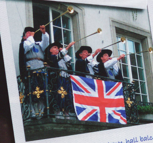
A royal fanfare from the town hall balcony greeting dignitaries from the UK

After 23 years being subjected to the ravages of London's atmospheric pollution – yet always managing to ring out loud and clear above the continuous cacophony of London traffic – the 27 bells that form the centrepiece of the famous Glockenspiel in Leicester Square have been enjoying a long convalescence in their birthplace, Aarau.