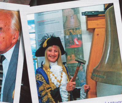
How's this for sound? The Lord Mayor tests one of the refurbished bells