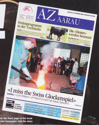
How the front page of the local Aarau newspaper told the story

Switzerland – in fact, all the councillors are regular visitors – adds: "We have an important mission to fulfil, and that is to see the return to London of our wonderful Glockenspiel after it has been restored here in Aarau.