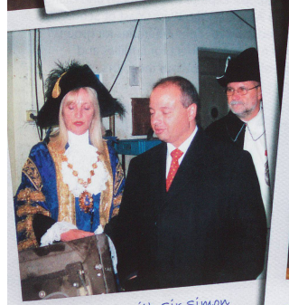
The Lord Mayor with Sir Simon Milton, Deputy Mayor of London in charge of policy and planning