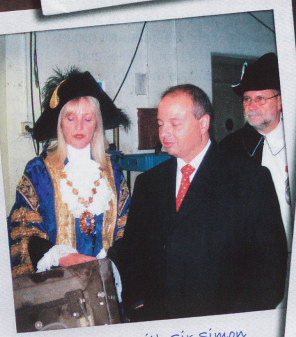
The Lord Mayor with Sir Simon Milton, Deputy Mayor of London in charge of policy and planning