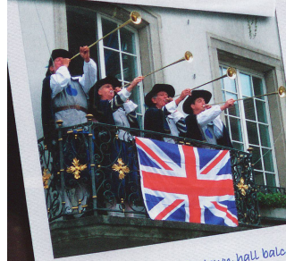
A royal fanfare from the town hall balcony greeting dignitaries from the UK