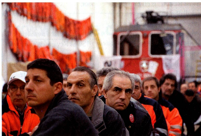
Didier Ruef: Railway workers on strike. The restructuring plan of SBB Cargo in Bellinzona involves 200 job cuts.