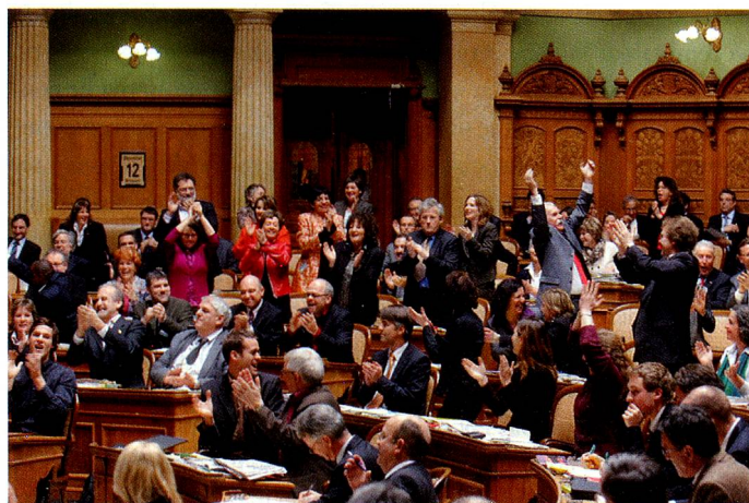
Peter Klaunzer: The political left in the Council applauds the news of Christoph Blocher's failure to get elected.