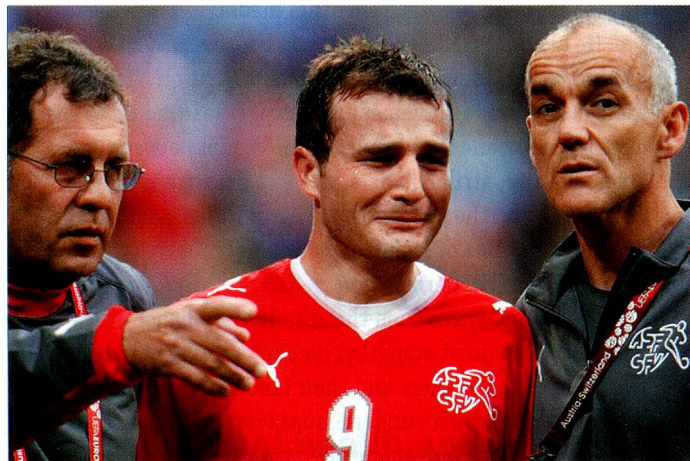
Alexander Frei, captain of the Swiss football team, limps out of the opening game of Euro 2008 against the Czechs.