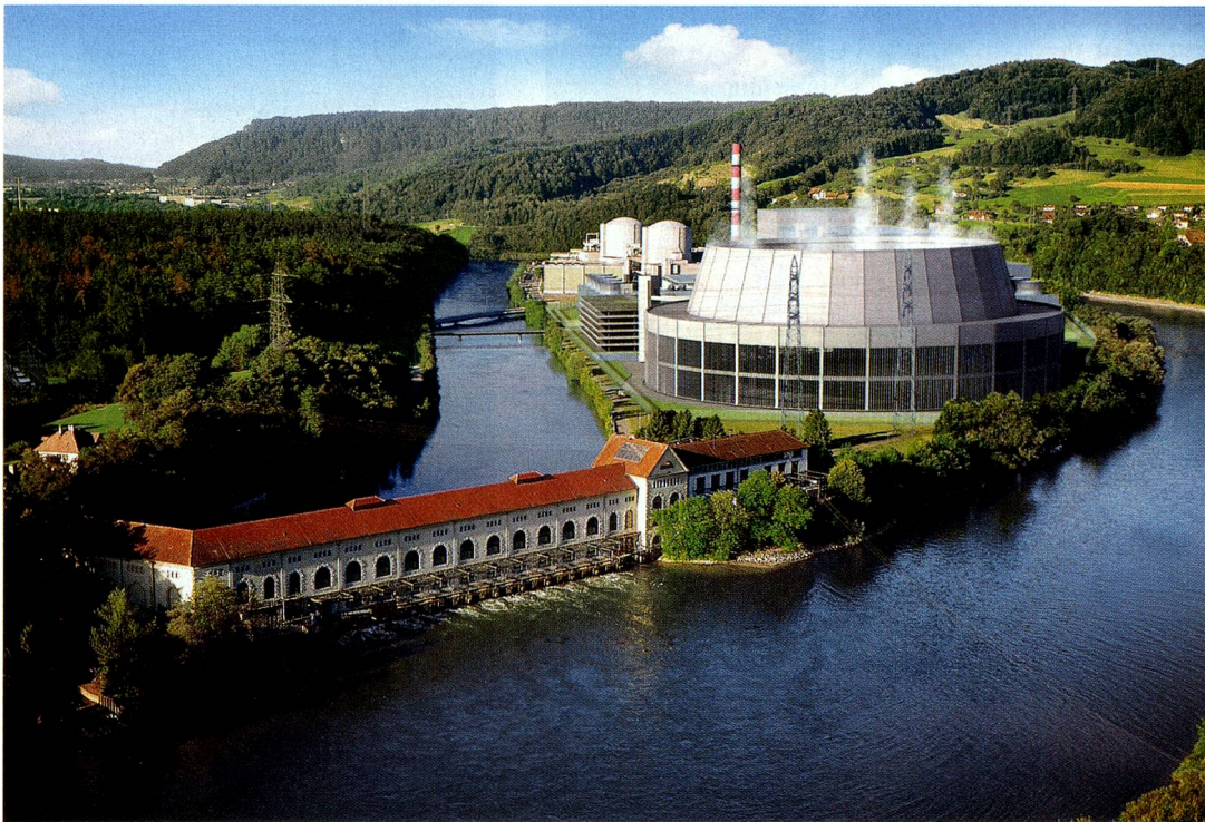
The Beznau project submitted

Words of warning from the electricity industry: the nation's power supply could be in jeopardy without new large-scale power stations. Do we really need new nuclear or gas-fired power plants, or can "green" electricity secure future energy supply? By Rolf Ribi