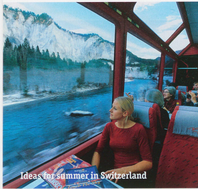
Ideas for summer in Switzerland