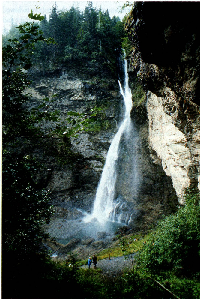
The Reichenbach Falls today near Meiringen.