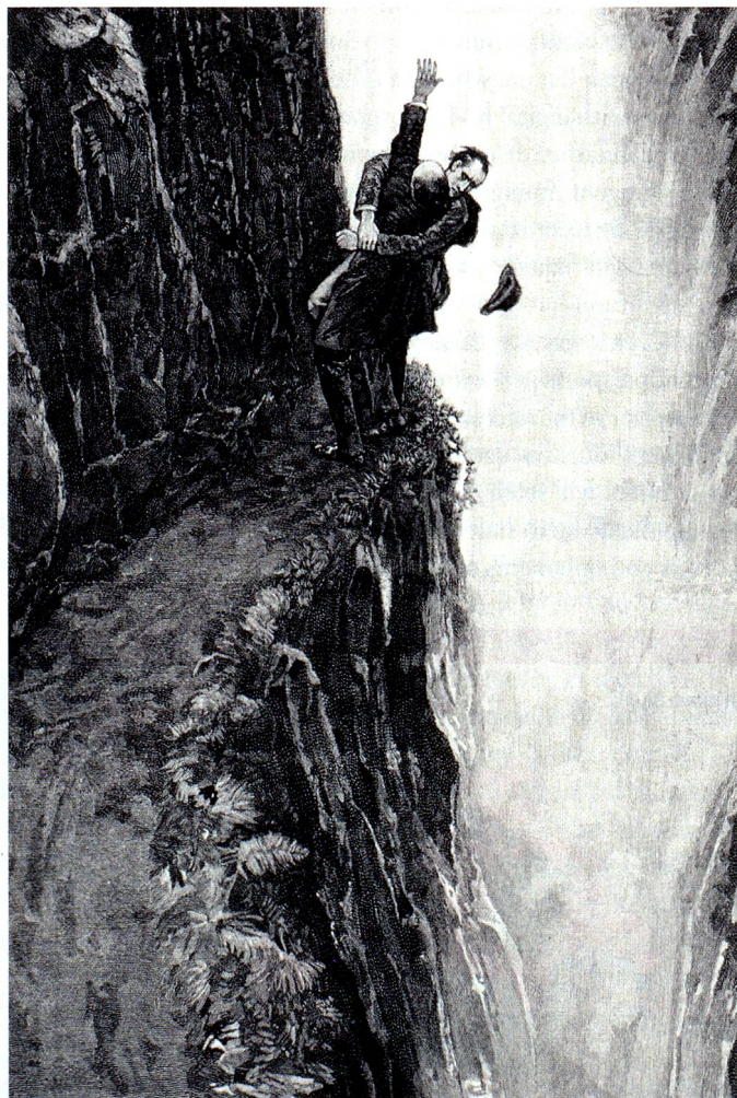
How Conan Doyle intended his hero to die at the Reichenbach Falls.

He stayed at the Park Hotel du Sauvage in Meiringen where a statue of Sherlock Holmes now sits imposingly in the garden. It is believed that Conan Doyle left Grindelwald, passing through Grosse Scheidegg, before finally descending into Meiringen. He would therefore have had a view from the top of the famous falls where the upper fall is almost 120 metres in height. He then decided to make it the setting for the presumed death of his hero in "The Final Problem" published in October 1893. The plot sees Sherlock Holmes uncover Professor Moriarty and his criminal organisation. But "the Napoleon of