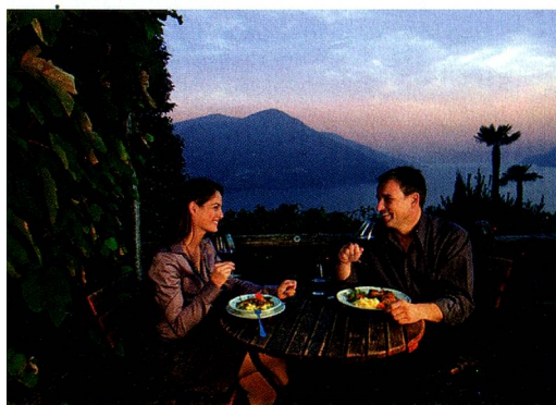
Grotto in the Canton of Ticino

Historical speciality of the Lucerne guilds Lozärner Chügeli-pastete from the 18th century, one of Lucerne's historical specialities, is tradition-