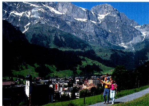
Engelberg (1000 m) in the Canton of Obwalden in Central Switzerland. Benedictine monastery from the 12th century.

park can be reached via the Rotair cable car which rotates 360°. Visitors enjoy a magnificent view of the central Alps at an altitude of 3020 metres. The landscape can be explored on foot along various topical trails (mountain flower trail, the "Tickle Path" and the Kneipp cure trail, etc.). Halfway up to the Titlis is the walkers' paradise of Trübsee, a popular starting point for hikes to a number of mountain lakes.