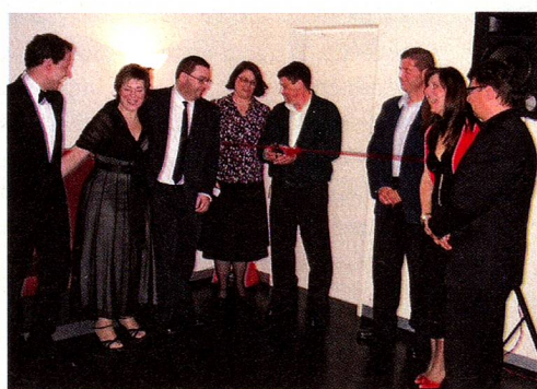
Opening of the second floor, Swiss Club of Victoria