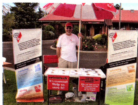
OSA taking part at the Swiss Festival

With the Swiss Yodelling Festival in Interlaken less than one year away, practicing our competition song has become a priority, but we are also keeping up with a good repertoire for other performances, like the recent evening of Swiss songs and music at the Strathdon Nursing Home in Forest Hill, and our traditional participation