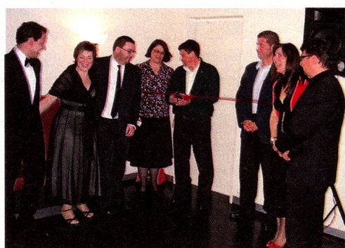
Opening of the second floor, Swiss Club of Victoria