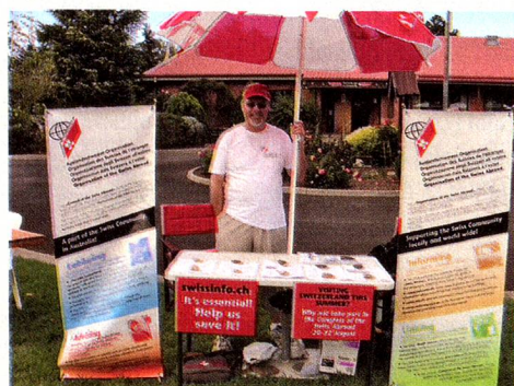
OSA taking part at the Swiss Festival

With the Swiss Yodelling Festival in Interlaken less than one year away, practicing our competition song has become a priority, but we are also keeping up with a good repertoire for other performances, like the recent evening of Swiss songs and music at the Strathdon Nursing Home in Forest Hill, and our traditional participation