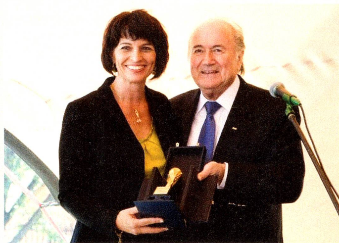
Doris Leuthard and Joseph Blatter

As guest of FIFA, the President of the Swiss Confederation, Doris Leuthard, accompanied by her husband, travelled to South Africa to attend the opening ceremony of the 2010 FIFA Soccer World Cup.