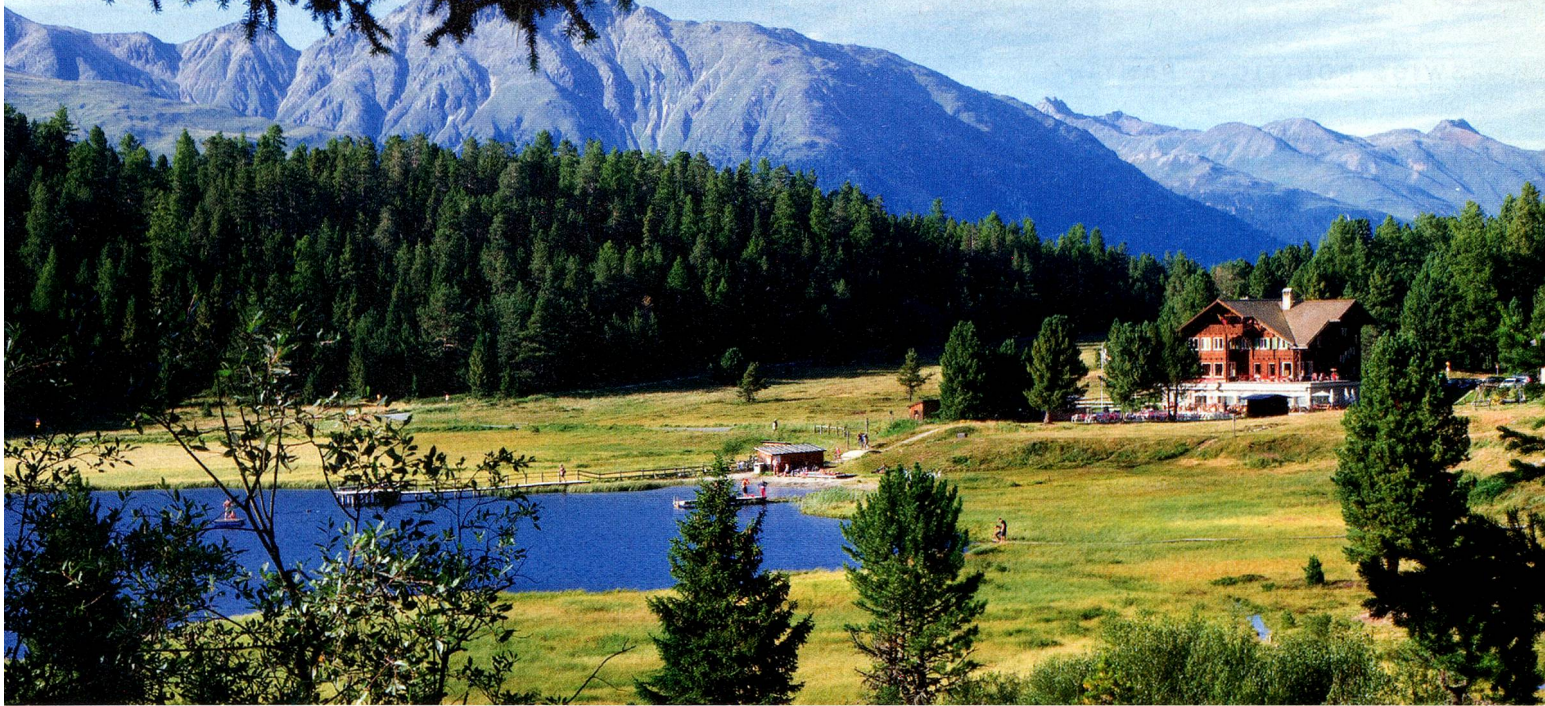
Hotel Lej da Staz, Lake Staz, St. Moritz