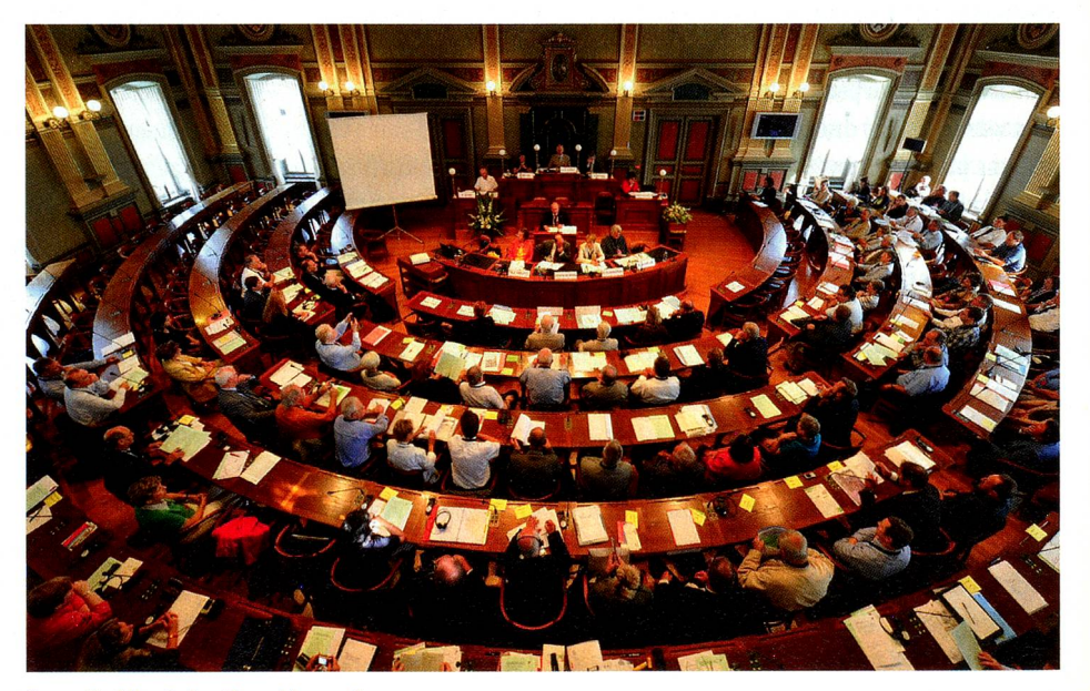
Council of the Swiss Abroad in session

The Organisation of the Swiss Abroad's new social network was also presented at