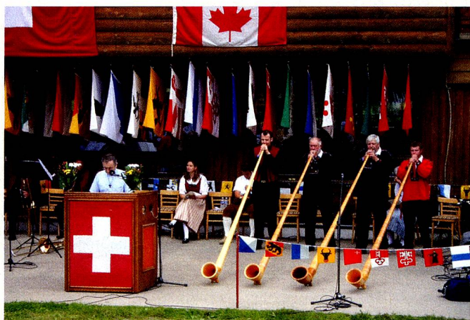
Célébration de la Fête Nationale au Mont Sutton

Des activités commencent dans la ville de Sutton le 29 juillet. Confirmez votre présence en tant que participant et/ou bénévole en écrivant à info@fedesuisse.com