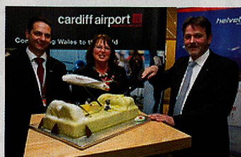
Celebrations to mark the start of the Zurich route