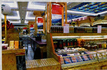
A Taste of Switzerland takes prime position in the Food Hall