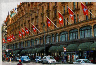
Swiss flags fly outside the iconic store in Knightsbridge