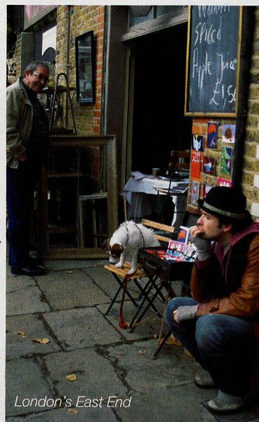
London's East End