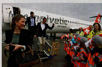
Children welcoming the arrival of the first Helvetic Airways flight