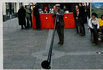
A Swiss horn blower performs at the opening festivities