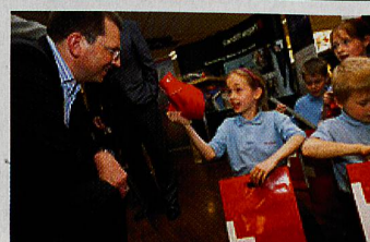
Helvetic Airways passenger chatting to Creigiau Primary School children