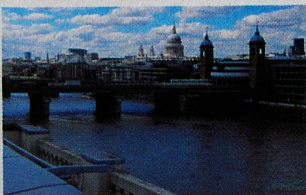
View across the Thames from the House of Switzerland

Further information and comprehensive job descriptions will be published on both the House of Switzerland website (currently under construction) and the Embassy's Website from mid-September 2011.