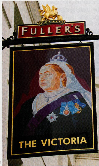
The Victoria Pub near Paddington station in London