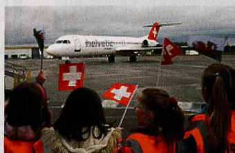
Swiss passengers welcomed to Wales by local primary school children