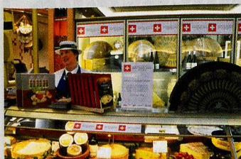
Swiss cheese dominated in Harrods' world-famous Food Hall