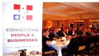
SACCI Swiss Ambassador Cup Dinner, 26 Sept, Melbourne; attendance: 102

The Corporate Luncheon on Sept. 6 with HE Mr Jose Manuel Barroso, President of the European Commission had an attendance of 360.