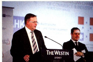
The Hon Anthony Albanese, 31 August, Sydney; attendance: 180