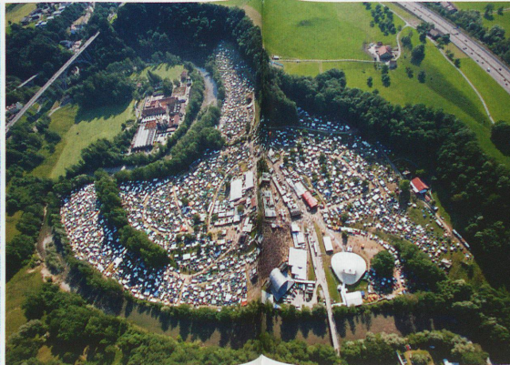
Sittertobel, OpenAir St. Gallen