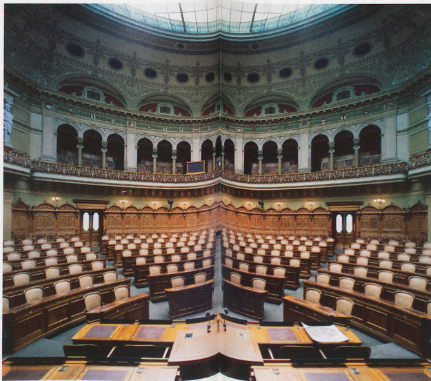
A look at the National Council chamber: the new distribution of seats with numerous centre parties will not make government easy.

The question remains as to why two traditional parties, the FDP and CVP, are continuing to decline while the "new centre" gains ground. Certain shifts, such as from the FDP to the Green Liberals, can be explained by environmental reasons. But overall the differences are negligible. In some cantons the BDP is a kind of protestant