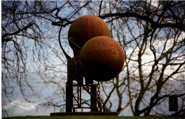
"Balls with wheel and chain"