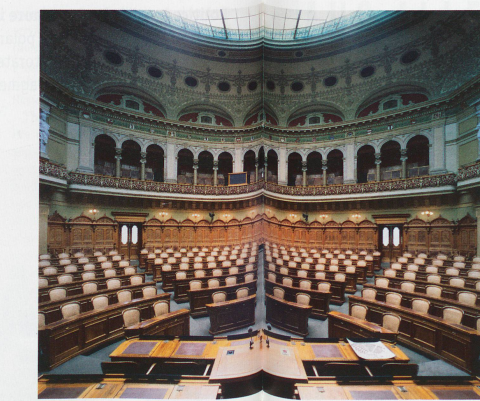
A look at the National Council chamber: the new distribution of seats with numerous centre parties will not make government easy.

In light of the ongoing international financial and economic crises, the new Parliament will have to act quickly to deal with the strength of the Swiss franc and the problems this is causing many export companies. The election results suggest that the electorate will seek concrete, implementable solutions in this difficult situation rather than back parties with absolute demands. The trend towards party-political polarisation, which had been ongoing since the 1990s, has come to a halt. The bottom line is that both the left-green camp and the SVP were losers on 23 October. However, both political factions continue to hold around 60 National Council seats each and can block projects together, albeit for different reasons. This occurred during the previous legislature