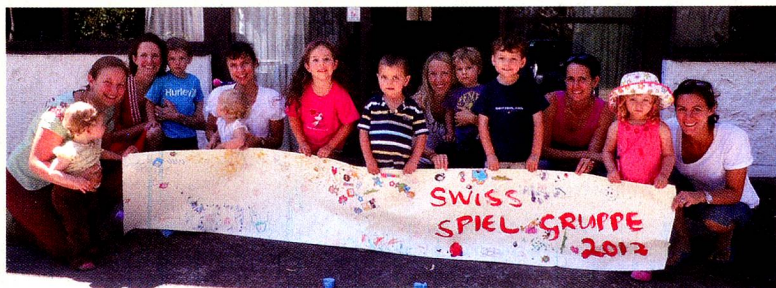
Swiss Playgroup of Sydney kids getting ready for fun in 2012