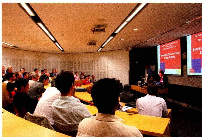
SAAN: First Swiss Alumni Meeting at the University of Sydney