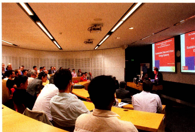
SAAN: First Swiss Alumni Meeting at the University of Sydney