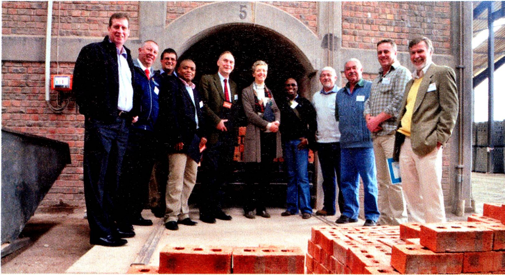
Swiss delegation at Langkloof Bricks SA-VSBK Shafts

The Clay Brick sector in South Africa is a modern, state-of-the-art industry as far as mining and brick production is concerned. However, faced with impending environmental regulations, the SA-VSBK brickfiring technology offers the brickmakers, especially those making use of some of the more traditional firing methods a cleaner and more, energy efficient alternative.