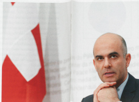
Alain Berset in his first media appearance as a Federal Councillor

Following her comfortable re-election, Eveline Widmer-Schlumpf was also the overwhelmingly popular choice for Swiss President for this year. Ueli Maurer is the Vice-President. Federal Councillor Didier Burkhalter is the new Head of the Federal Department of Foreign Affairs (FDFA). Since his election to the Federal Council in 2009, the Free Democrat from Neuchâtel had directed the Federal Department of Home Affairs (FDHA). The FDHA is now headed by Alain Berset. The other five Federal Councillors will continue in the same departments they directed before the elections.