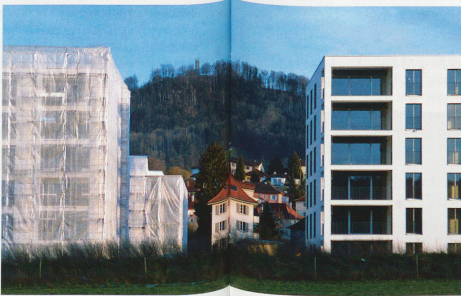
Köniz in Switzerland's Central Plateau – not always a picturesque sight despite the Wakker Prize for "exemplary urban development"