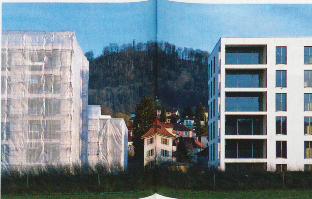
Köniz in Switzerland's Central Plateau – not always a harmonious sight despite the Wakker Prize for "exemplary urban development"