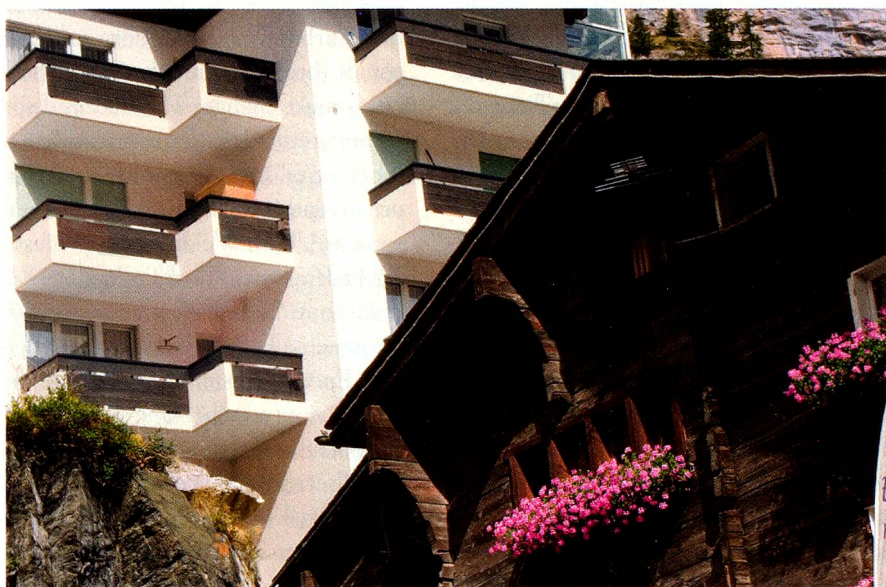
Davos and Zermatt: These pictures clearly show why the second homes initiative was approved