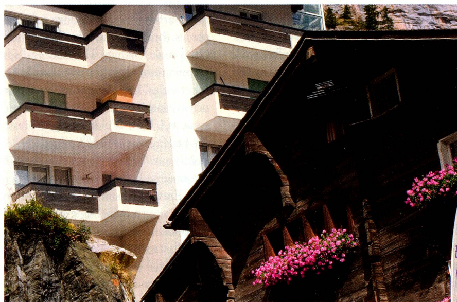
Davos and Zermatt: These pictures clearly show why the second homes initiative was approved