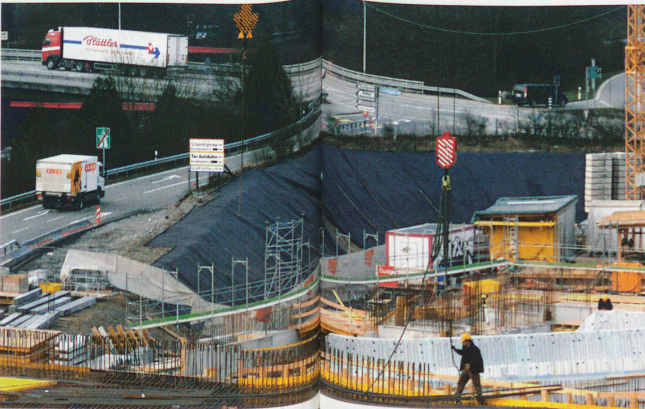
Bern-Brünnen – the development of a leisure and shopping centre with 11 cinema halls, 10 restaurants, a hotel and an adventure pool

Central Plateau in recent decades. But pressure is now growing on forests close to urban centres. A highly charged debate is currently taking place in Berne over whether parts of the Bremgartenwald forest should be cleared to create an urban settlement for 8,000 people. The main argument is that clearing forests near to cities results in less urban sprawl than converting green meadows into building zones on the outskirts of the city.