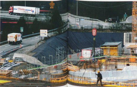
Bern-Brünnen – the development of a leisure and shopping centre with 11 cinema halls, 10 restaurants, a hotel and an adventure pool

Central Plateau in recent decades. But pressure is now growing on forests close to urban centres. A highly charged debate is currently taking place in Berne over whether parts of the Bremgartenwald forest should be cleared to create an urban settlement for 8,000 people. The main argument is that clearing forests near to cities results in less urban sprawl than converting green meadows into building zones on the outskirts of the city.