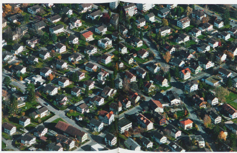
Near Buchs in the canton of St. Gallen – one single-family home after another

Environmentally friendly urbanisation is establishing itself as the new benchmark. In contrast, the previously dogged protection of forests is increasingly being called into question, although it was in this particular area that federal government's spatial planning was most effective. The basic principle that forests can only be cleared if reforestation takes place elsewhere has meant that forestry land has been preserved even in the