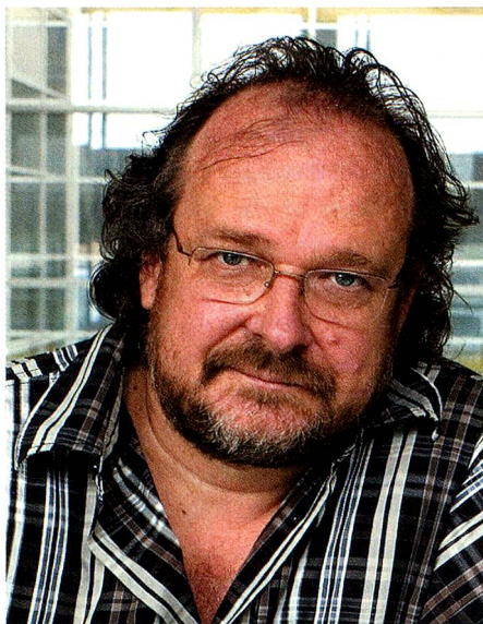
Creator of "Swatch": Elmar Mock