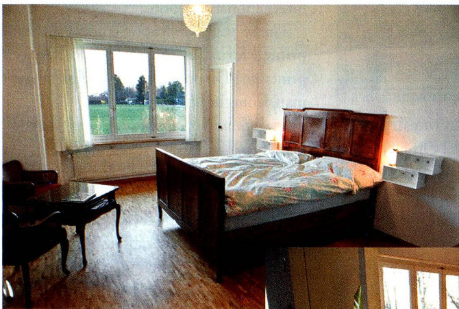
Im Klee, Bed & Breakfast, Melchenbühlweg 8, 3013 Berne +41 31 931 35 35 www.imklee.ch, schlafen@imklee.ch