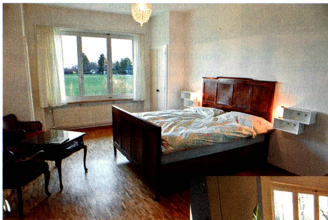
Im Klee, Bed & Breakfast, Melchenbühlweg 8, 3013 Berne +41 31 931 35 35 www.imklee.ch, schlafen@imklee.ch

south-facing side of the building with fantastic views of the Alps – cost between 75 and 130 Swiss francs per night (single and double rooms, discounts apply for longer stays). Two rooms have running water, while showers and bathrooms are located on the landings. Parking spaces are available in front of the building, and public transport and the well-known "Schöngrün" restaurant are nearby. BE