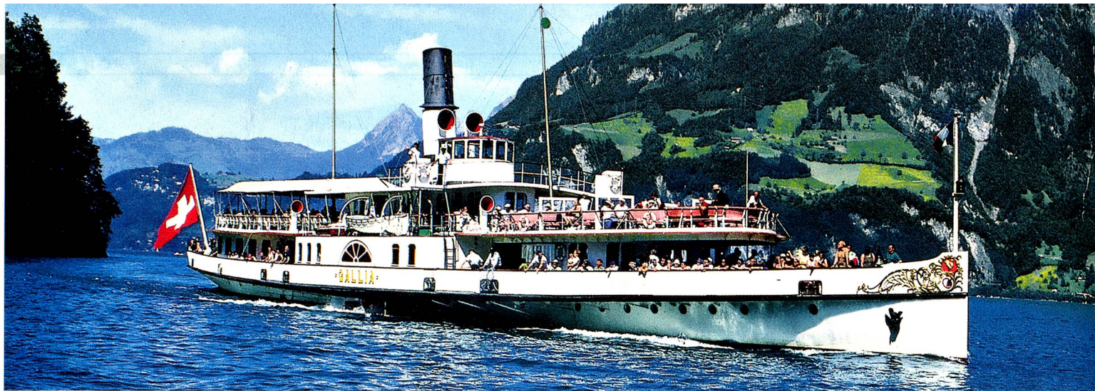
Wilhelm Tell Express on Lake Lucerne, Central Switzerland