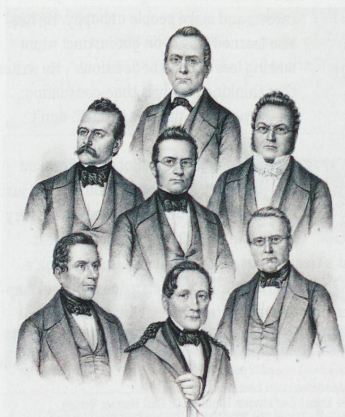
The first Federal Council in 1848. Swiss President Jonas Furrer in the centre, with Josef Munzinger, Henri Druey, Wilhelm Matthias Naeff, Friedrich Frey-Hérosé, Stefano Francini and Ulrich Ochsenbein (clockwise from top)