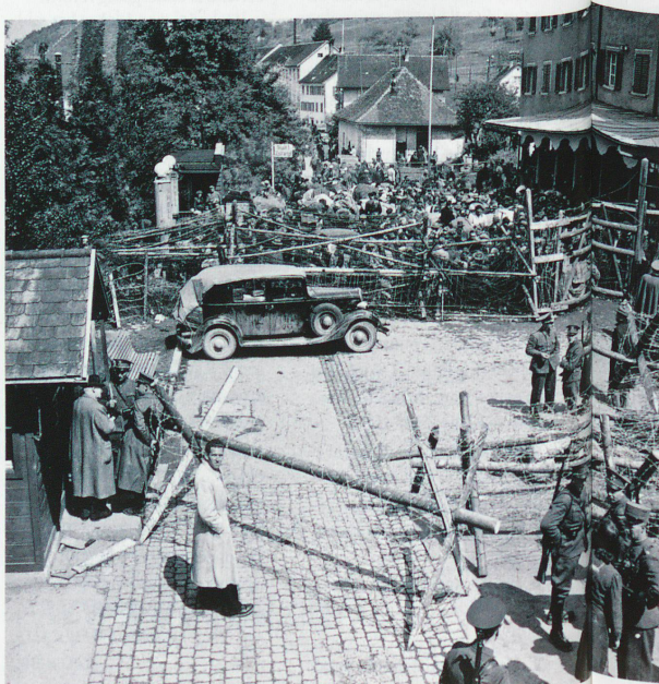
Refugees at the St. Margrethen border fence near St. Gallen in May 1945