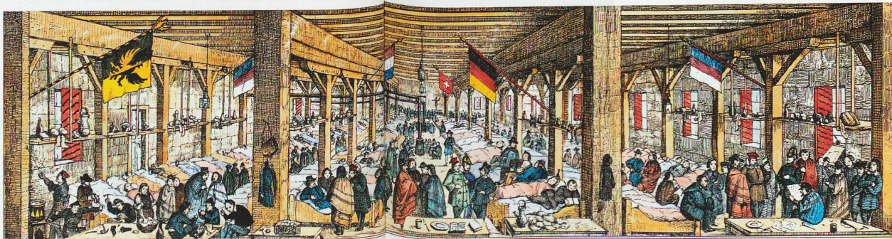
Großer Flüchtlings-Saal im Kornhaus in Bern, Januar 1850. Salon des réfugiés

"Schweizer Geschichte im Bild"; HIER+JETZT Basel; 292 pages, 425 images; ISBN 978-3-03919-244-1; CHF 78, EUR 60; www.hierundjetzt.ch