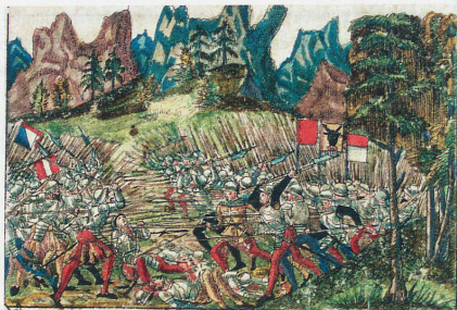
The Battle of Morgarten (1315) was the first military encounter between the Swiss and the Habsburgs. Depiction from Christoph Silbereysen's pictorial chronicles of 1576