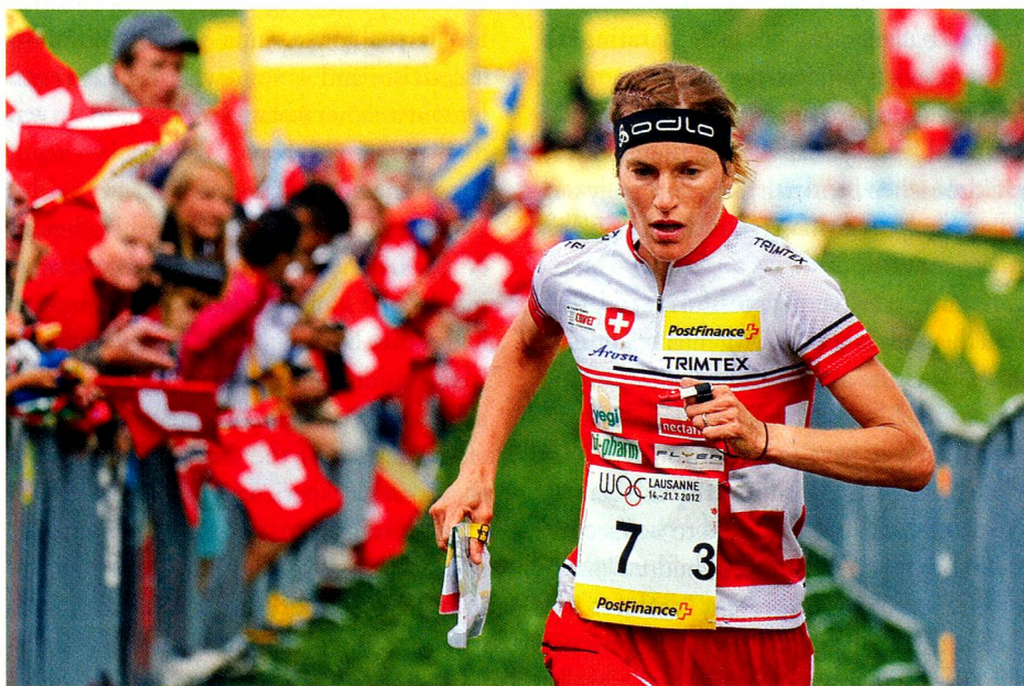
Crossing the finishing line at the World Championships in Lausanne

Niggli-Luder's tremendous successes mean that people almost forget that orienteering is a peripheral sport in Switzerland. Just under 10,000 Swiss actively participate in orienteering. However, the figure is rising due to the "Niggli effect", as