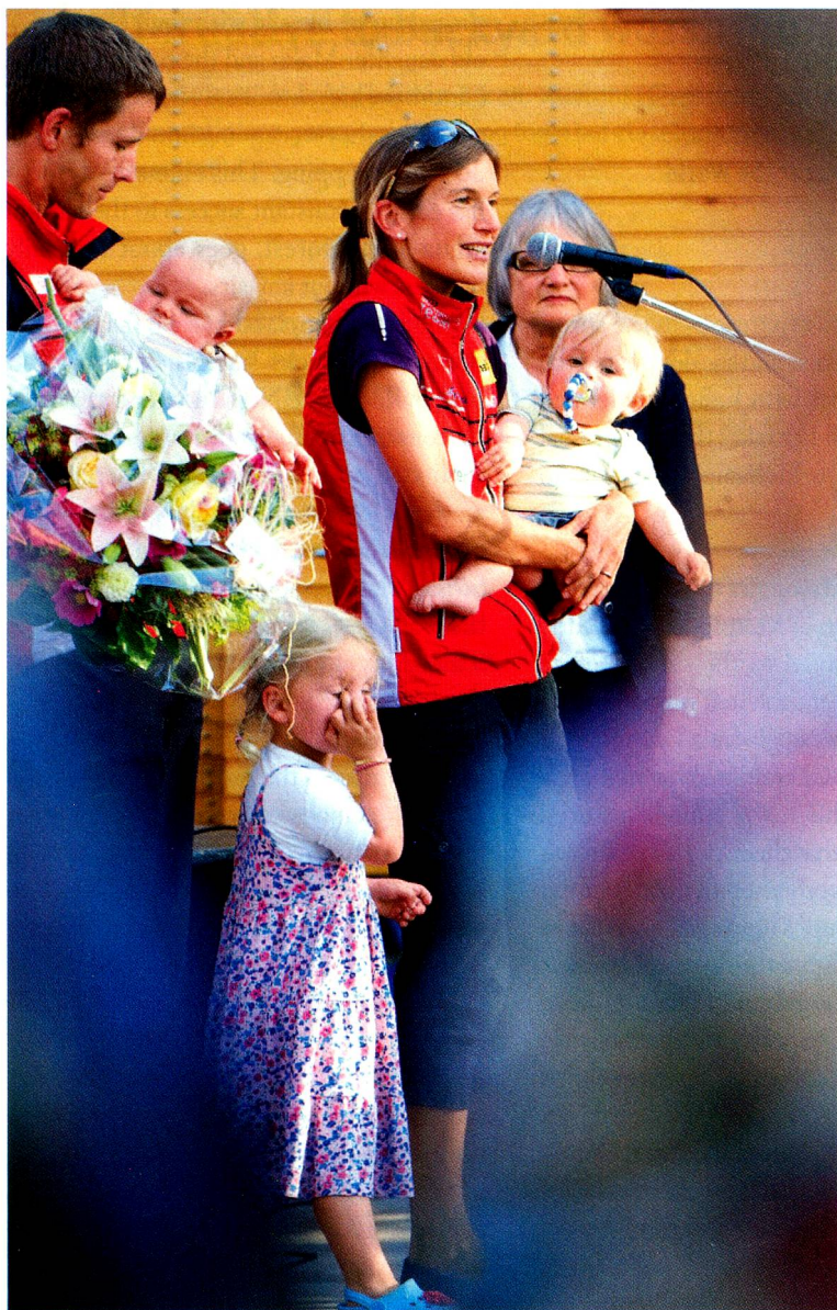
With her husband and children at the reception in Münsingen after the World Championships