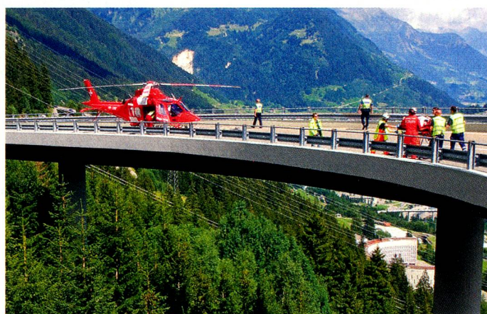
Deployment in traffic accidents: Rega is often called upon by the police

The air ambulance jets are sometimes used to transport foreign soldiers to their homeland from war zones. Rega actually carries out such operations on behalf of international insurance companies if they are medically necessary. As far as Rega is concerned, their passengers are simply patients, whether they are in uniform or not. It also points out that the clients are invoiced the full cost in such cases, including accommodation expenses and aircraft depreciation. Patron contributions have never been used for contract flights. The Swiss Foundation Supervisory Board exonerated Rega and acquitted it of charges of "misuse of the Swiss cross" and violation of the purpose of its foundation.