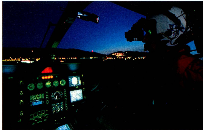
In the cockpit of a helicopter on a night flight