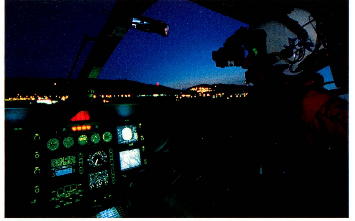
In the cockpit of a helicopter on a night flight