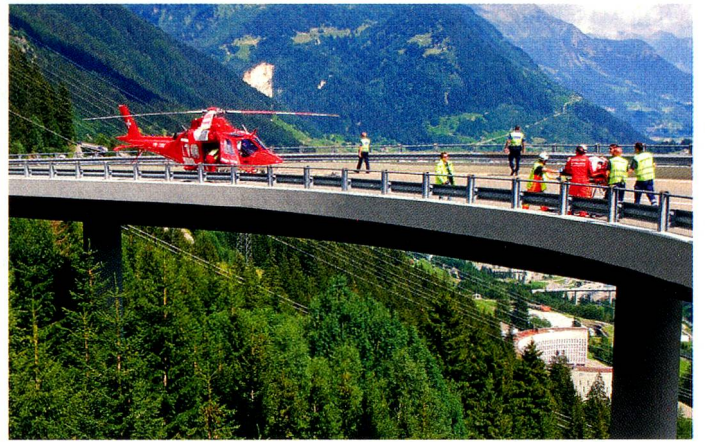
Deployment in traffic accidents: Rega is often called upon by the police

The air ambulance jets are sometimes used to transport foreign soldiers to their homeland from war zones. Rega actually carries out such operations on behalf of international insurance companies if they are medically necessary. As far as Rega is concerned, their passengers are simply patients, whether they are in uniform or not. It also points out that the clients are invoiced the full cost in such cases, including accommodation expenses and aircraft depreciation. Patron contributions have never been used for contract flights. The Swiss Foundation Supervisory Board exonerated Rega and acquitted it of charges of "misuse of the Swiss cross" and violation of the purpose of its foundation.