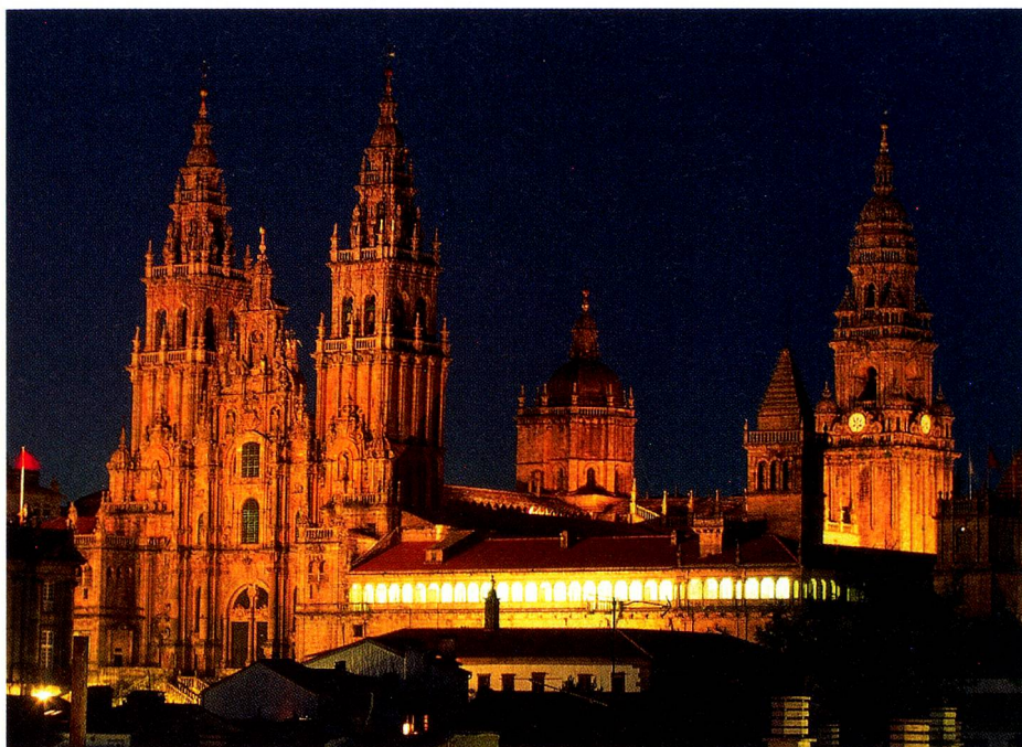
The cathedral of Santiago de Compostela