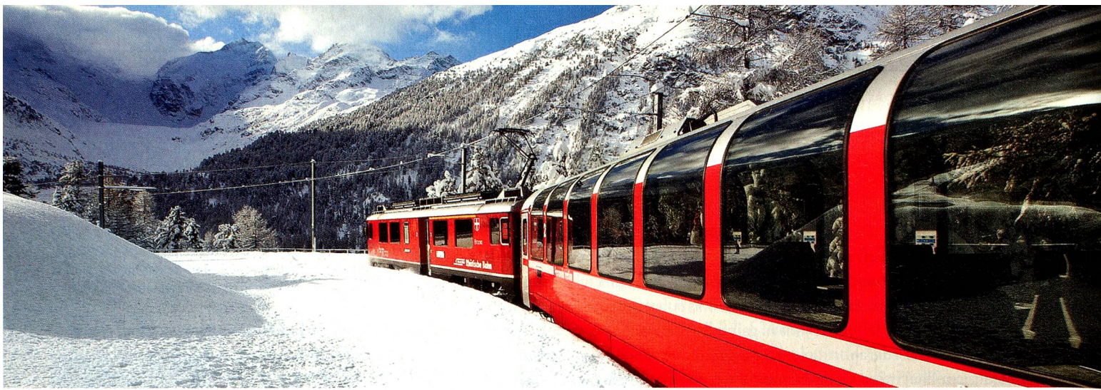
Bernina Express at Lake Bianco, Graubünden