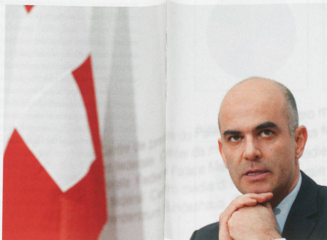
Alain Berset in his first media appearance as a Federal Councillor

Following her comfortable re-election, Eveline Widmer-Schlumpf was also the overwhelmingly popular choice for Swiss President for this year. Ueli Maurer is the Vice-President. Federal Councillor Didier Burkhalter is the new Head of the Federal Department of Foreign Affairs (FDFA). Since his election to the Federal Council in 2009, the Free Democrat from Neuchâtel had directed the Federal Department of Home Affairs (FDHA). The FDHA is now headed by Alain Berset. The other five Federal Councillors will continue in the same departments they directed before the elections.