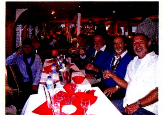
Yodelers @ Harbor Cruise