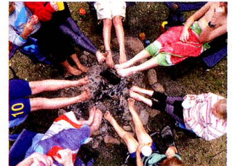
Upper Colo River Camping weekend

We are a group of Swiss/Australian, Swiss/International families that get together every first Sunday of the month from 11am.