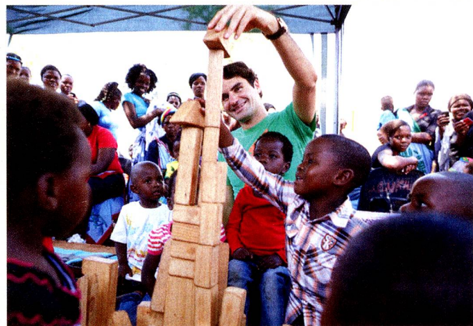
14000 children in South Africa alone benefit from the Federer Foundation.