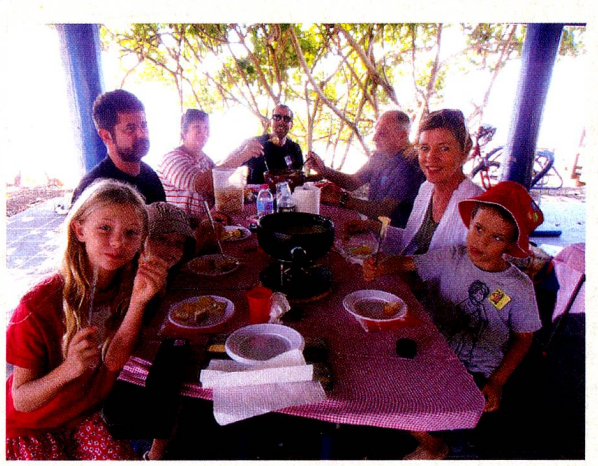
Swiss Fondue at the Beach. Fraser Coast Swiss Group, QLD

phone +41 44 466 9000 fax +41 44 461 9010 www.swiss-moving-service.ch info@swiss-moving-service.ch