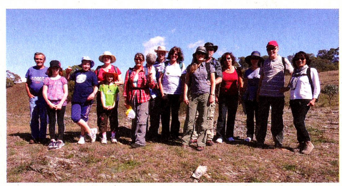
Members of the Canberra Swiss Club before the walk to London bridge at the upper end of Googong dam

22/6 Fondue, North Perth Bolwling Club (please check our website for updates)