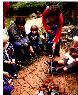
Children & parents grilling servelat am Spies at our August Playgroup!