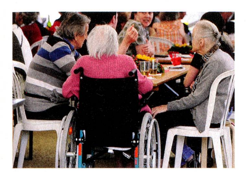
The proportion of elderly people in the population is rising all the time

forms in recent years. Whether he succeeds in tackling one of the greatest challenges of the future – the increase in the number of