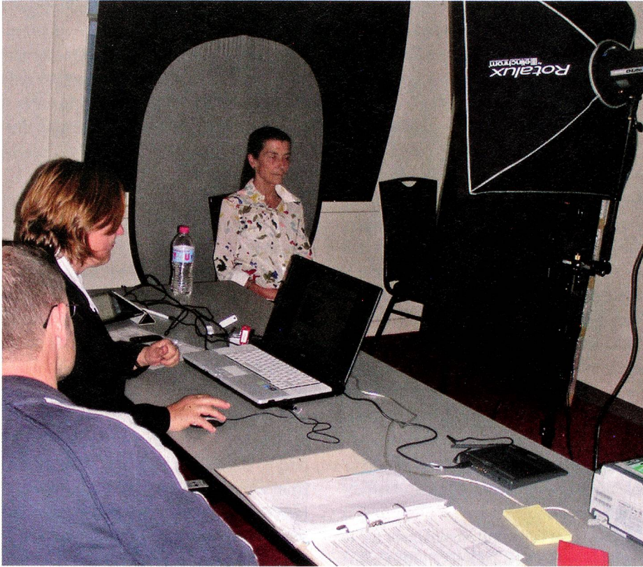
Swiss citizens having the data required for a new passport recorded by the mobile unit