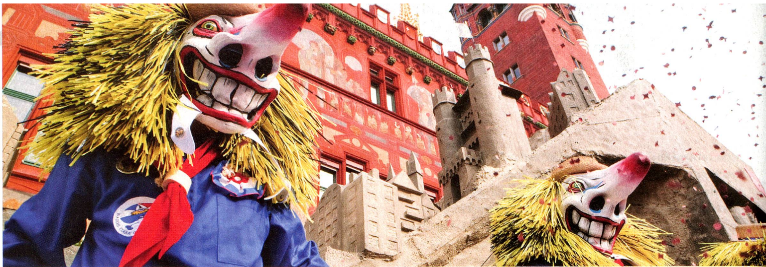
Carnival in Basel, Basel Region