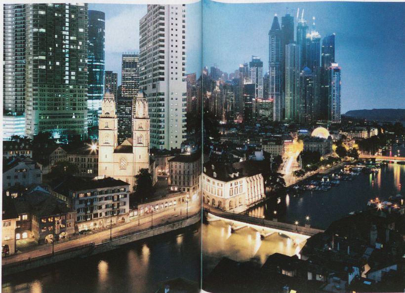
A scenario presented by critics of immigration for the city of Zurich

Switzerland has had a relatively high proportion of foreigners for some time. The share of permanent foreign residents stood at 15% as far back as 1910. After a decline during the two world wars, this level was reached again in 1980. The high proportion of foreigners is not least a result of Switzerland’s restrictive naturalisation procedure. In the event of high levels of immigration