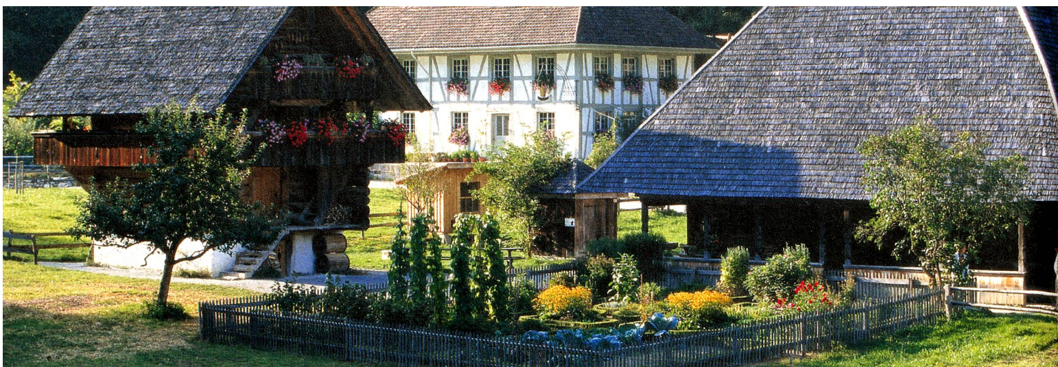
Ballenberg, the open-air museum of rural culture, Bernese Oberland