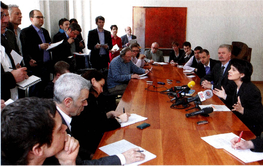
14 March 2011: Federal Councillor Doris Leuthard outlines the government's energy turnaround plans to the media in the parliament building

After the seemingly never-ending cold and wet winter weather, the sunshine finally appeared in Switzerland at the end of May. But the good weather had hardly settled before storm clouds gathered over the federal capital, Berne. There was a ferocious debate over the service life of Switzerland's nuclear power stations in the National Council in June. Should the nuclear power plants, all of which are somewhat outmoded, be allowed to operate indefinitely provided constant investment is made in their safety? Or should they have an officially decreed decommissioning date when they will be shut down definitively?