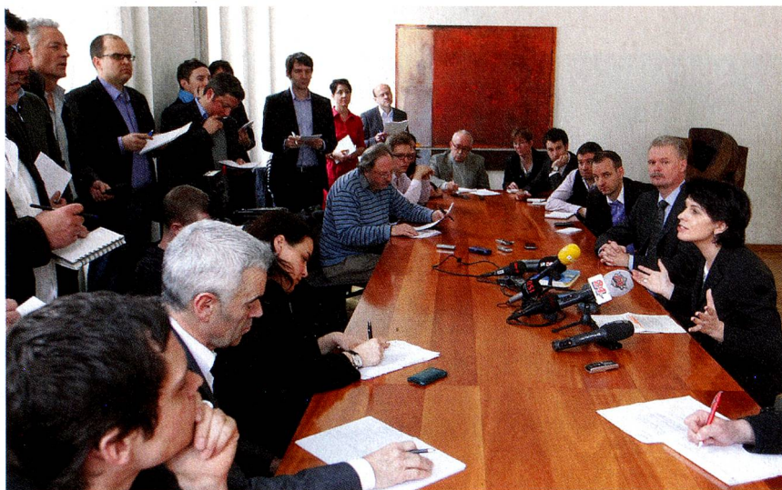
14 March 2011: Federal Councillor Doris Leuthard outlines the government's energy turnaround plans to the media in the parliament building

After the seemingly never-ending cold and wet winter weather, the sunshine finally appeared in Switzerland at the end of May. But the good weather had hardly settled before storm clouds gathered over the federal capital, Berne. There was a ferocious debate over the service life of Switzerland's nuclear power stations in the National Council in June. Should the nuclear power plants, all of which are somewhat outmoded, be allowed to operate indefinitely provided constant investment is made in their safety? Or should they have an officially decreed decommissioning date when they will be shut down definitively?