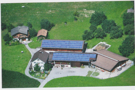
A glimpse into the future: rooftop solar panels in Schiers (Grisons), countryside dotted with wind turbines in southern Germany, and the façades of older buildings newly clad with solar paneling, as at the Sihlweid building project in Zurich