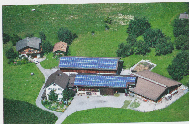
A glimpse into the future: rooftop solar panels in Schiers (Grisons), countryside dotted with wind turbines in southern Germany, and the façades of older buildings newly clad with solar panelling, as at the Sihlweid building project in Zurich