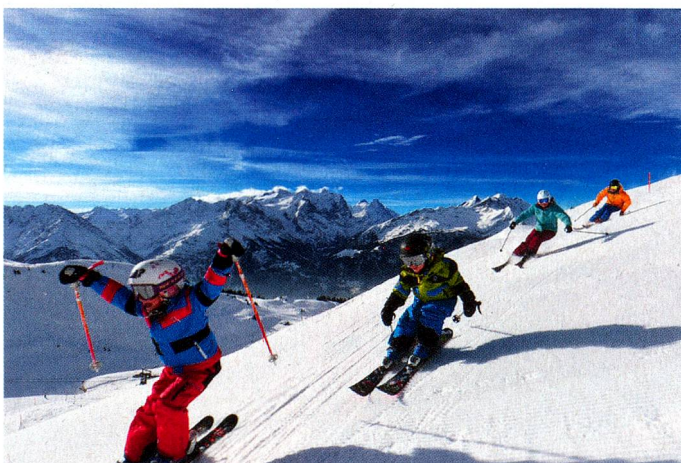
No longer satisfying tourists: the magnificent alpine panorama at the Gornergrat in the top photo and the pristine ski slopes

Even more alarming to the promoters of Swiss tourism are other developments, such as climate change. When glaciers melt, tourist attractions are lost. A striking example of this is the Rhone glacier at the top corner of the canton of Valais. It has been shrinking in volume year after year, reducing the certainty of snow in resorts at lower levels and increasing the potential threat of natural catastrophes. Diminishing interest in skiing is