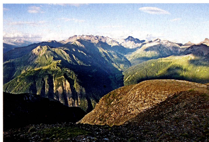
Special attractions: the "Titlis Cliff Walk" at 3,020 metres, the highest suspension bridge in Europe, and the 180 km 2 Binn Valley nature park in Valais

visitors will come as well. That might be true in the short term. Wyss doubts, however, that suspension bridges will generate a long-term increase in the number of visitors. In fact, one might wonder why anybody would come back to a valley multiple times simply because of a suspension bridge.