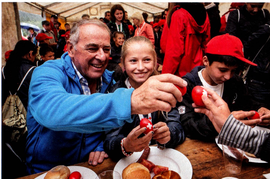
Adolf Ogi with children from Eastern Europe who receive medical care thanks to the Swisscor foundation

You sometimes have to observe things at a sufficient distance. For example, in summer 1992, NASA's space shuttle Atlantis sped around Earth 127 times. Claude Nicollier, Switzerland's first and only astronaut to date, was aboard. It was a big step for Nicollier and a giant step for Swiss space travel. The shuttle hurtled around the planet at 30,000 kilometres an hour. It is just that what Nicollier did in the freezing depths of outer space left no mark on Switzerland's collective consciousness. In contrast, the words that Federal Councillor Adolf Ogi shouted to Nicollier through the ether on 7 August 1992 via a sophisticated radio link remain etched in the mind: "Freude herrscht, Monsieur Nicollier!" (Joy abounds, Monsieur Nicollier!) – the words of congratulation immediately became a turn of phrase. Quoted thousands of times, it has become part of Swiss German vocabulary. Joy is even more wonderful when it not only exists but is ubiquitous, when "joy abounds".