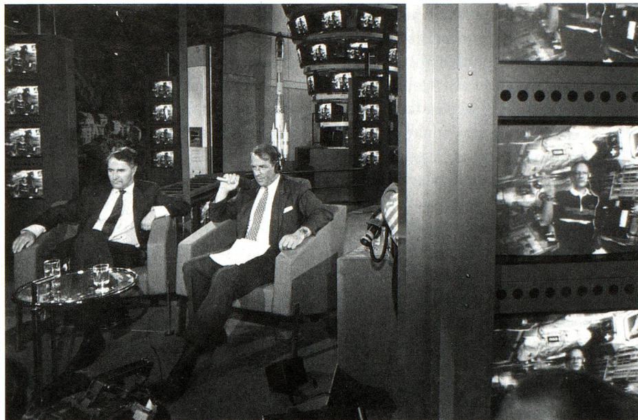
During the direct link-up with Claude Nicollier in the Atlantis space shuttle in August 1992

Swisscor is Ogi's social legacy from his Federal Council days. The "Freude herrscht" (Joy Abounds) foundation, which he also founded, combines social and sporting aspects. This institution aims to encourage children to participate in sport and exercise.