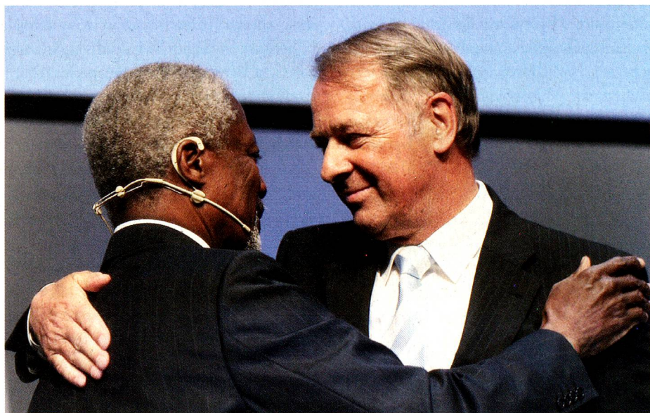
Embracing former UN Secretary-General and friend Kofi Annan at the WEF in Davos in 2007