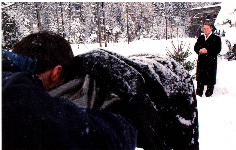
New Year's address as Swiss President in front of the Lötschberg tunnel in Kandersteg in December 1999