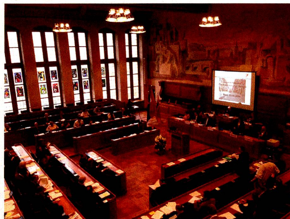
CSA Spring Meeting in the Rathaus in Bern, March 22, 2014.

phone +41 44 466 9000 fax +41 44 461 9010 www.swiss-moving-service.ch info@swiss-moving-service.ch