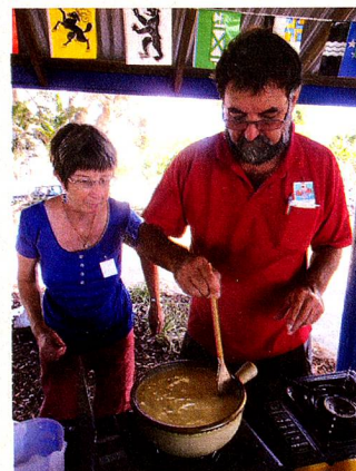
Join us at the "Cheese fondue with Koalas", Fraser Coast Swiss Group