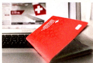
The new Auslandschweizer-Gesetz has been ratified

minimum of 20% Swiss scholars at Swiss Schools outside Switzerland. There is however a new clause, that such Swiss Schools have to admit scholars with a Swiss passport.