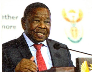
South African Higher Education and Training Minister Blade Nzimande

the whole private sector to follow in the footsteps of the Swiss Chamber of Commerce," Nzimande said.