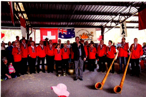
Swiss Yodlers of Sydney

On 29 November, we will perform at the Senior's lunch at the Concordia Club in Tempe.