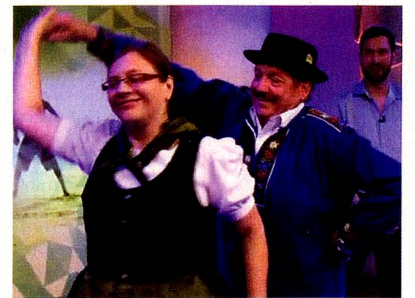
Swiss Dance off

We thank the embassy for their support in providing red caps for us all and soccer jerseys to borrow.