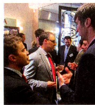
SwissCham EuroMix Eat, Meet & Greet in Sydney and Melbourne 10 & 17 Sept 2014

Book Cover 'Swiss Alps to Antarctic Glaciers', launched at the Swiss Club of Victoria on Sep 11.