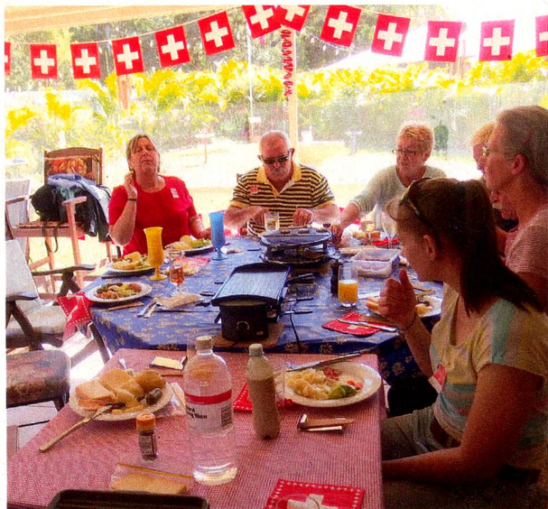
Swiss Raclette, Fraser Coast