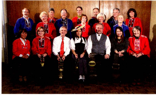
'Crèmeschnitte Chörli' Canberra Swiss choir

Spring in Canberra is an exciting time for soul and mind. It marks the end of winter and gives way to a season full of colours in 'Floriade', the flower festival bringing new life into the city. This is a fabulous time of the year. But that's not all, we have more reason to celebrate. The German Choral Festival 'Sängerfest 2014' is held for the first