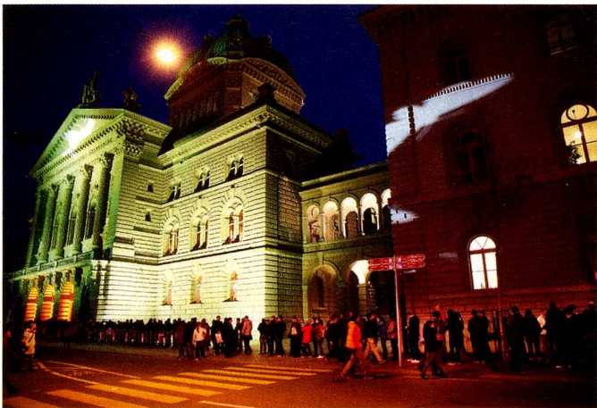
Around 4,000 visitors during the Museum Night.

Virtual tour: www.parlamentsgebaeude-tour.ch