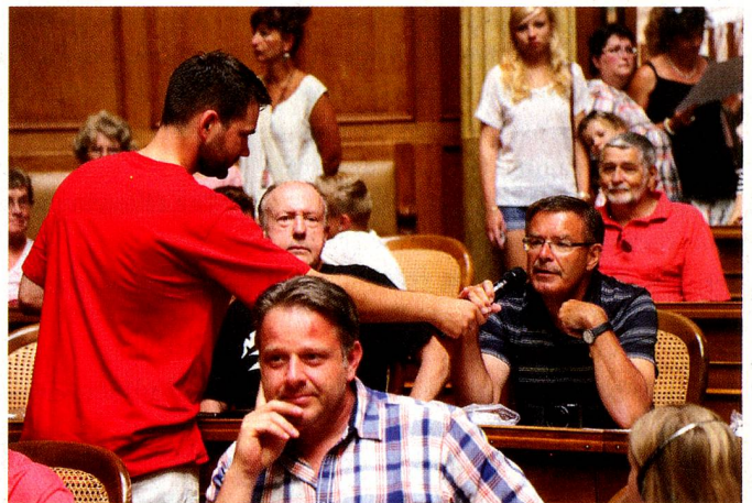
A visitor takes the microphone during the Open Day.