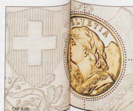
The six-franc "Gold Vreneli" stamp from 2013 with 18-carat gold