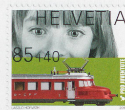
Pro Juventute stamp with a charitable surcharge from 2013