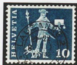
Almost 1.5 billion of this 10-cent stamp have been printed since 1960