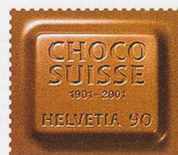
The "Chocosuisse" from 2001 has a chocolate aroma