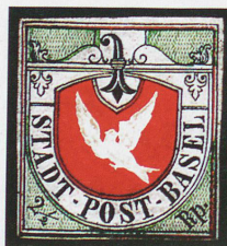
Expensive collector's item: "Basler Taube" from 1845