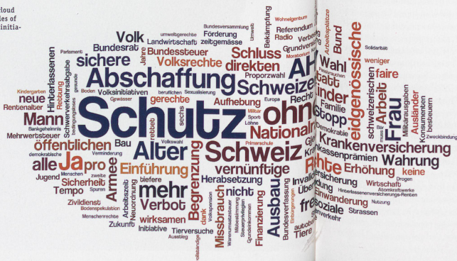
A word cloud from titles of popular initiatives