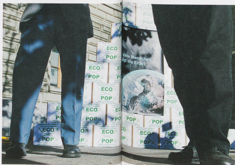
"How many people can the Earth sustain?" is the question that was posed by the Ecopop group on their poster when they submitted the signatures for the initiative in Berne on 12 November 2012

Ecopop, the term being a combination of ECOlogy and POPulation, is a prismatic organisation which appeals to a wide range of groups, including critics of growth as well as xenophobic factions. Ecopop perceives itself as a politically independent environmental organisation which focuses on population issues. Its homepage states: "Our goal is to preserve the natural environment and the quality of life in Switzerland and worldwide for future generations. Ecopop has been committed to opposing the overburdening of nature by an increasingly higher human population for over 40 years." A clear political categorisation of the organisation is not possible. It was founded at the time of the excessive immigration initiatives put forward by James Schwarzenbach, but Ecopop rejected the initiatives of his National Action (NA) movement in the 1970s and 1980s. In the early days, NA President Valentin Oehen and Bernese SP city councillor and femi-